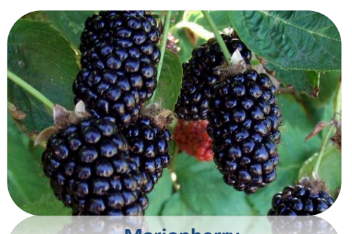
Marionberry (Rubus L. subgenus Rubus)

Boysenberries were developed accidentally in California through multiple crosses, but became a national best-seller for their plump, juicy, complex flavor. Boysenberries are tart on the Bay, but the "Nectar Berry" variety is better suited to our cool summers. Foster Ave and Western Ave.