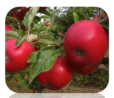
"Akane" Apple (Malus domestica)

The "King" Apple is one of the easiest apples to ripen around the Bay. It's a large apple with sweet flavor and a local favorite in commercial orchards. The tree grows vigorously and large. The fruit ripens in August. Old Arcata Road