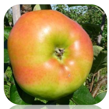
"King" Apple (Malus domestica)

A classic summertime apple, the Macintosh has done well in both Arcata and McKinleyville back yards, producing sweet, crisp apples early in the season. Windsong neighborhood.