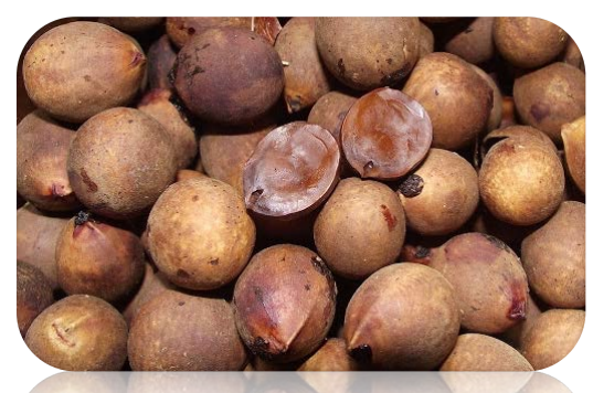
Pepperwood/California Bay Laurel Nuts (Umbellularia californica)

The relative to madrone is juicy and sweet, but also mushy and rather seedy. The peeling bark and sinuous shapes are reason enough to plant one, but the fruit is fun and one of the first in June. Founders Hall at HSU, parking lots at Eureka Natural Foods and the Arcata Co-op.