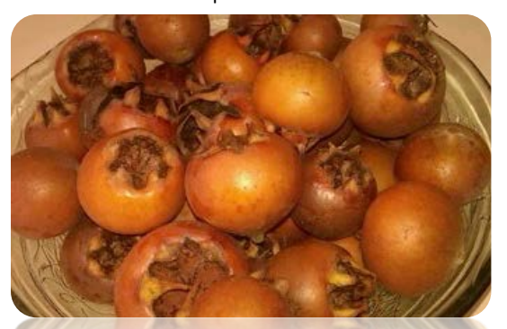
Medlar (Mespilus germanica)

The Comice and its close relative, the Duchesse d'Angouleme" are tender to the touch, juicy, sweet and buttery, when ripe. These related pears are both somewhat fireblight resistant, which is helpful around the humid Humboldt Bay.