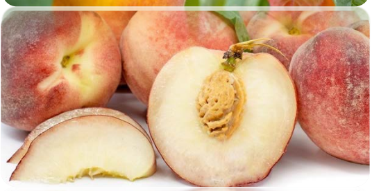
"Blood," "Frost," "Avalon Pride," "Betty," "Charlotte" and "Q-1-8" Peaches (Prunus persica)

The purple Blood peach was developed by the Tsalagi (Cherokee) Nation for hundreds of years after its arrival from Europe ~1500. Yellow-fleshed peaches were developed in China, and the dependable yellow Frost variety is fibrous, juicy and sweet, while the Charlotte is crisp and sturdy. Avalon Pride is a small, flavorful semi-freestone, and Betty is sweet and productive. For fans of white fleshed peaches, only the" Q-1-8 " has proven itself, on Old Arcata Road, while the purple and yellow flesh peaches have proven themselves on 17<sup>th</sup> and Foster Ave, Arcata.