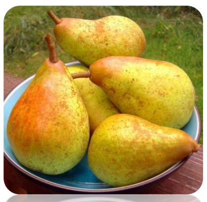
"Orcas" Pear (Pyrus communis)

Few pears ripen without cracking around the Bay, but a green Bartlett pear has thrived and produced nearly scab-free pears for 30 years on 11th St in Arcata, and the related "Delicious" variety is productive on Redmond Road. European pears need well drained soil and cross-pollination.