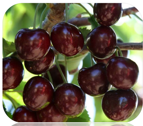
Sweet Cherries: "Lapin," "Stella," and "Bing" (Prunus avium)

Dry Gardening Established fruit trees want, but do not <u>need</u> to be watered during the summer. Six inches mulch 2-3 feet out from the stem base will save you watering and weeding all summer. The Neukoms dry farm peaches in Willow Creek using a "dust mulch" from dragging a 6" deep tiller. Straw is cheap, water is expensive, and fruits taste better and more intensely when they have not been watered down with irrigation.