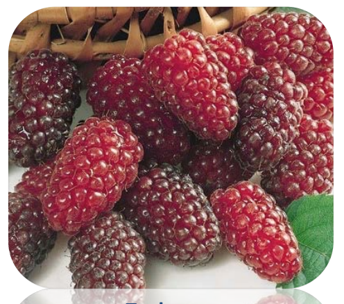
Tayberry (Rubus fruticosus x ideaus)

The marionberry is our most productive berry on long, heavily fruit laden canes. They are perfect for trellises and training on fences or the side of your house. The berries are sour until almost overripe—they're best in smoothies or cooked in pies and preserves. Foster Ave and Roberts Way.