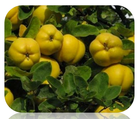
"Kaunching" Quince (Cydonia oblanga)

Medlars were popular in Europe around the 12th century, but are mostly a novelty today—apple sauce packaged in its own skin! Medlars are like dates, Hachiya persimmons or jujube berries that shrivel on the tree until soft, or "bletted", but they can be picked earlier and ripened sepals down on paper. When finished bletting, medlars are brown, soft and taste like caramel, applesauce or cinnamon custard. Medlars produce fruit in just two years and grow so thickly they can be used for topiaries. Plant in full sun and somewhat wind protected. Roberts Way, Foster Ave, 17th St.