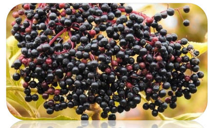
Native Blue and "Adams" Elderberry (Sambucus nigra L. ssp. Caerulea and Sambucus canadensis)

The native Blue Elderberry is sweet, as is the European "Adams" elderberry. These elderberries are sweet enough for wine. "Adams" will fruit better with a crosspollinating variety such as "Black Lace," which has gorgeous purple foliage and a modest amount of fruit. Local forests as well as Roberts Way and the Greenway Building Gardens.