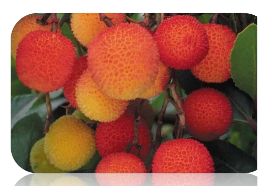
Strawberry Tree (Arbutus unedo)

The "Golden Nectar" is an early-bearing, bright yellow, famously sweet plum but is not successful every year due to the need for heat. A healthy, mature one was loaded in 2013 on G St, Arcata. The "Shiro" is more dependable, but has smaller plums. A successful grove of them is planted at the Courtyards of Arcata food forest on Guintoli Lane.