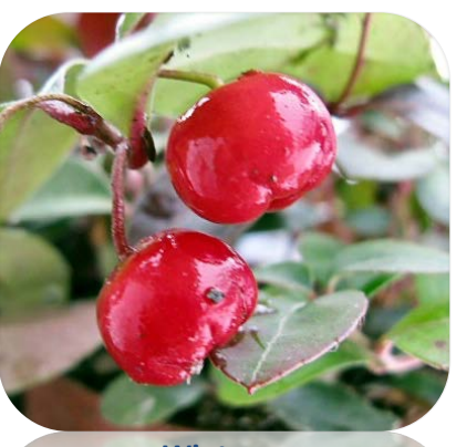
Wintergreen (Gaultheria procumbens)

Extremely hardy, vigorous, disease-free rose will form a thicket if left unchecked. Huge sweet/tart and mushy rosehips form after fragrant blooms on young canes, good for eating fresh or making into jam, wine, etc. Rose petals are edible.