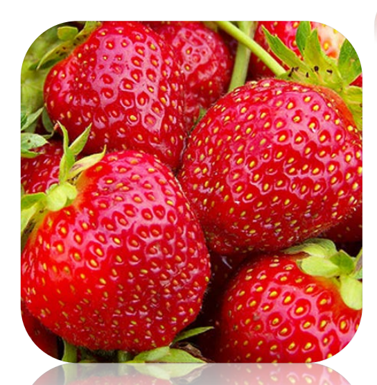
"Albion," "Seascape," "Hood Junebearing," "Tristar," & "Chandler" Strawberries (Fragaria x ananassa)

Our native California Blackberries fruit in the Dunes in July, a month or more before the invasive Himalaya blackberries. The native berry is distinctly more flavorful, making a fruitier jam and a more enjoyable handful. Unfortunately they can be light bearers for the amount of thicket they create, and they require direct sun to sweeten up. Natural thickets with enough berries to make it worth your while are found on the North Jetty near the airport/drag strip.