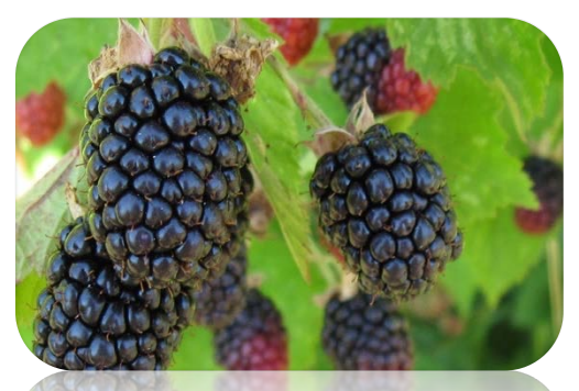
Triple Crown Thornless Blackberry (Rubus ideaus)

Many different varieties of garden strawberries will grow around the Bay, but local strawberry farmers say Albion is most resistant to the Spotted Fruit Fly larvae. Seascape and Chandler are large and productive. Gardeners appreciate the flavors of Tristar and Hood Junebearing. They do very well with straw bedding to keep down weeds, prevent berry rot and deter slugs. Rice straw is high in silica and resists rot best in our climate.