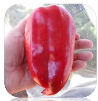
Sweet Pepper "Elephant Ears" (Capsicum anuum)