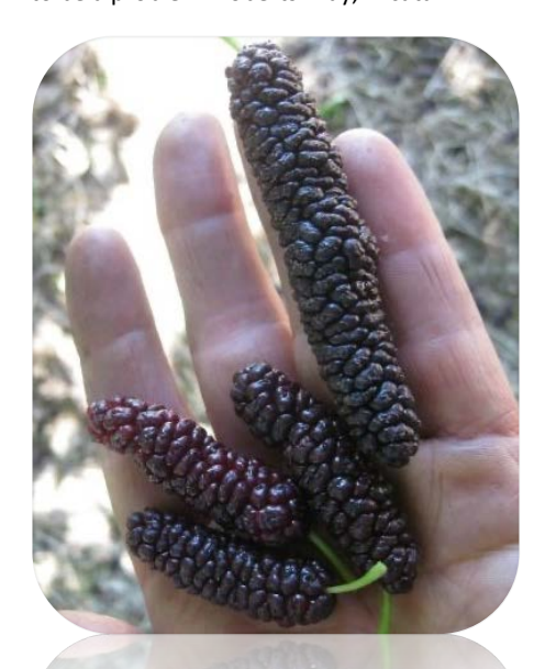
"Long" Mulberry var. Pakistan (Morus macroura)

Cornelian Cherry is actually a dogwood species from Greece with fruit similar to tart pie cherries that ripen until they fall from a gently shaken tree. Cornelian cherries are partially self-fertile but will do better when planted in pairs. "Yellow" is excitingly tangy with mango notes, and the only yellow varietyothers are red. "Red Star" is an excellent fruiter, "Pioneer" and "Elegant" are almost as good. A common purplish leaf discoloration doesn't appear to be a problem. Roberts Way, Arcata.