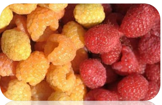
Raspberries (Rubus ideaus)

The Triple Crown Thornless is a superb berry—named for its three pre-eminent traits: flavor, productivity and vigor. It will give you fresh berries for a month straight. If you have room for only one blackberry, this is a great choice. The berries are enormous, and sweet. Foster Ave.