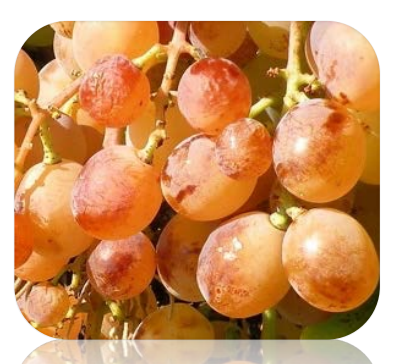
"Muscat of Alexandria" (Vitis vinifera)

There are 200 varieties of Muscat grapes, which are perhaps the oldest family of domesticated grapes. They have sweet and exotic flavors that makes them a favorite for table grapes and in desert wines. Very successful on Q St and Foster Ave, Arcata