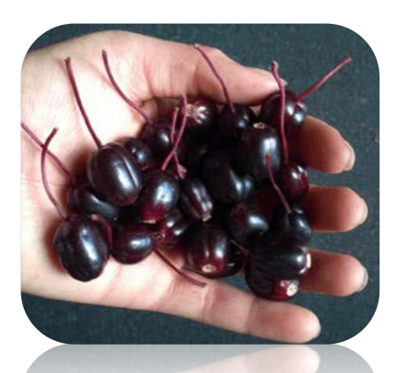
Fuchsia berries (Fuchsia splendens and others)

Fuchsia species have surprisingly sweet juicy berries, although sometimes peppery. Roberts Way, Foster Ave.