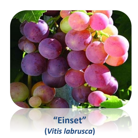
A medium sized seedless table grapes famous for tasting like strawberries. Prefers to grow on longer canes. Growing in a wind protected garden near Wildberries.

Arctic kiwis are a large family of related vines, and the "Hero" variety has proven to be a successful variety in Arcata, with sweet and flavorful berries growing on a fence in mixed shade and sun. They are slow-growing in our area due to the cool summers, but are invasive in the forests of Massachusetts. Roberts Way.