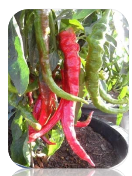
"Deux des Landes Basque" (Capsicum anuum)

If given enough time (e.g. 80 days), some peppers can ripen in the cool summer weather on the Humboldt Bay. The Serbian paprika-type "Elephant Ears" sweet pepper is meaty and sweet, and the only non-hot pepper that turns red on the Bay. Hot peppers include Red Rocoto from the cool Andes mountains, the hot frying pepper "Doux Des Landes Basque" from alpine southwestern France, and the Serrano pepper "Tampiqueno" on Mad River Road, Foster Ave, and Blakeslee in Arcata.