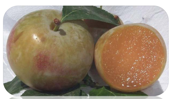
"Greengage" Plums (Prunus domestica ssp. italica var. claudiana)

The "Greengage" is a family of ancient heirloom plums developed in France from Turkish wild types and grown throughout Europe as a choice desert plum, frequently cooked in syrup to make a plum compote. The greenish colored flesh seems to confuse birds and the Greengage escapes being pecked. Richmond Road.