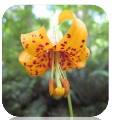
Panther Lily (Lilium pardilanum)