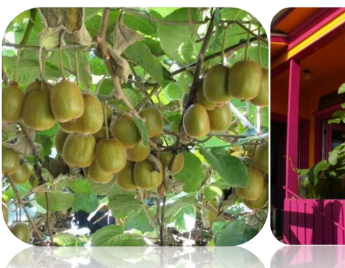
"Blake", "Hayward" and "Vincent" Fuzzy Kiwi (Actinidia deliciosa)

Small and sweet kiwis are available around the Bay, and the "Blake," "Hayward" and "Vincent" varieties have proven themselves. Kiwis grow vines big enough to swallow a house and must be pruned to keep them under control. They are a sexed plant, so a male and a female are necessary for fruit. However, hand pollination is easy if your friend has a male in blossom and you have a female. CCAT, Foster Ave, Roberts Way.