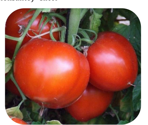
"San Francisco Fog"