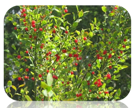
Huckleberries (Vaccinium parvifolium, V. ovatum, others)

Tart-sweet, slightly astringent black and red huckleberries are native to Humboldt Bay and perfect for native gardens. Natives and cultivars of the closely related species do very well in 3/4ths sun with abundant, small, intensely flavored berries. Black and blue species bear more heavily than the milder tasting red huckleberries. Ma-le'l Dunes, Western Ave, former CCAT native gardens and Roberts Way.