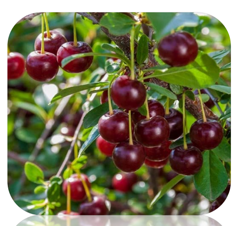
Tart Pie Cherries: "Surefire," "Morello," "Montmorency" and "Carmine Jewel" (Prunus cerasus and P. cerasus x P. fruiticosa)

Few of the 17 different species of mulberries seem to fruit well in the Humboldt Bay area, perhaps needing hotter summers, but the "Long" species is from the Himalayan mountains and grows extraordinarily long, honey-sweet berries. Pakistan is one of many varieties. Spear Ave.