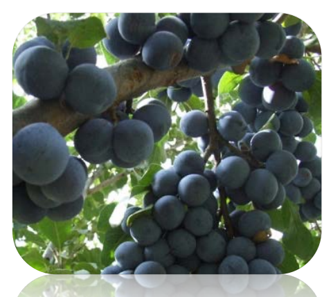
"Damson" Plum (Prunus institia)

Disagreements are rife among prune fans as to which is best (French is sweetest...), but all three similar varieties are self-fertile, do well around the Bay and their fruit ripens all at once, requiring the gardener to quickly dry, eat, or give away the plums. Thin the heavily loaded branches so they don't break! Roberts Way and Hilfiker St, Arcata.