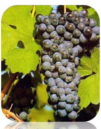
"Barbera" Grapes (Vitis vinifera)

There are 200 varieties of Muscat grapes, which are perhaps the oldest family of domesticated grapes. They have sweet and exotic flavors that makes them a favorite for table grapes and in desert wines. Very successful on Q St and Foster Ave, Arcata