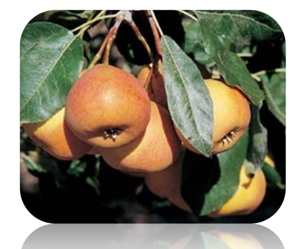
Shipova (X Sorbopyrus auricularis)

Hamese is the earliest, juiciest and most refreshing (the author's favorite local pear), Shinseiki is smaller but sweet and perfumed, while 20th Century and Atago are thicker skinned and harvested a few weeks later. Leave Asian Pear on the tree until they are swollen and yellowed for best flavor. The trees are vigorous growers and the pears are sweet, juicy, and medium-large if thinned early in the season to allow the remaining pears to grow larger. Hilfiker St, Foster Ave, 8 Roberts Way.