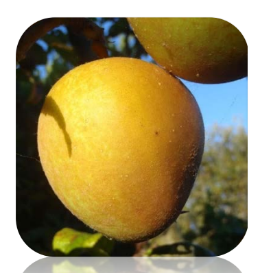
"Hudson's Golden Gem" Apple (Malus domestica)

The scarlet red flesh of this apple smells like cotton candy and strawberries. The apple is mildly sweet-tart and bright red even when cooked. The rare variety hails from Mount Hood, Oregon.