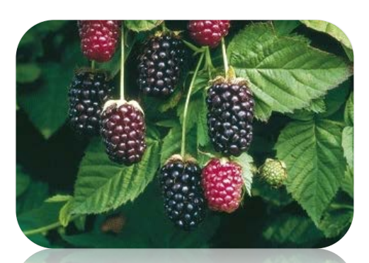
Boysenberry, var. "Nectar Berry" "Rubus spp x"

Loganberries are a hybrid of particularly flavorful blackberries and raspberries accidentally created in 1883 by a Santa Cruz lawyer. They ripen early and set large numbers of berries that are not ripe until purple. Loganberries are sweet enough to enjoy off the bush and can replace blackberries and raspberries in jam and pie recipes.