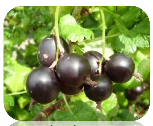
Jostaberry (Ribes nigra x R. diverticatum x R. uva-crispa)

The Jostaberry is a highly recommended sweet-tart cross of black currant and two types of gooseberries. It's a large shrub with early July berries and no thorns, perfect for small children. It is also somewhat resistant to the currant worm. Foster Ave, Roberts Way, Arcata.