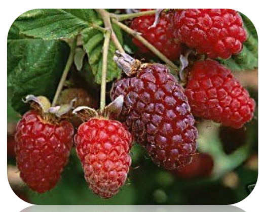
Loganberry (Rubus × loganobaccus)

Many raspberry varieties, both yellow and red, are successful around the Bay. They prefer to be mowed down every year or two so the roots can grow healthy new stems. Raspberry fruits are wonderful and their leaves make an excellent tea. Do not mulch with pine or you will introduce a deadly virus to your raspberries.