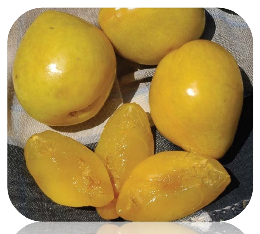
"Golden Nectar" and "Shiro" Plums (Prunus salicina)

-Pluots, Seabuckthorn/Seaberry and Avocados have not yet fruited in any of the Humboldt Bay plantings.