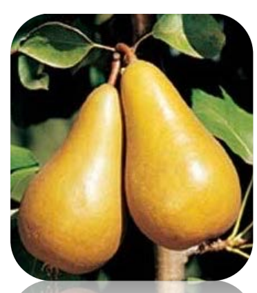
"Bosc" Pear (Pyrus communis)

Orcas pears are mild, sweet and one of the most scab resistant varieties of the Pacific North West. This variety was found in an orchard on Orcas Island, Washington.