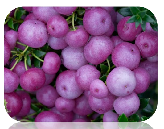
Chilean Wintergreen (Gaultheria mucronata)

This species grows throughout South America and is highly variable, with pleasant, juicy and wintergreen-tasting purple to pink to snow white berries on bushes 1-5' tall.