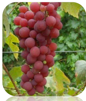
"Vanessa" (Vitis labrusca)

A seedless table grape that is good fresh or as raisins. Vigorous, disease resistant vines. Developed from the same parents as Himrod, although Interlaken may have higher yields and ripen earlier. Near Wildberries.