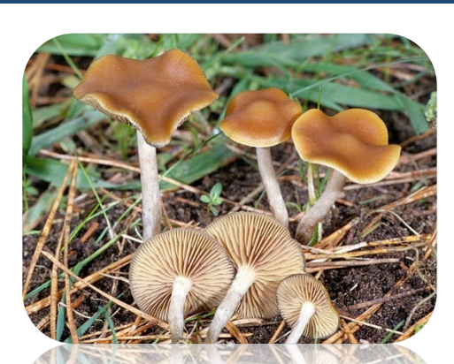
Wavy Caps (Psilocybe cyanescens)

Stropharia were historically grown with corn in Europe because they supported corn health with their habit of eating nematodes (microscopic worms). They can grow large and meaty, and like most mushrooms they taste delicious fried in butter and garlic. Roberts Way, Fungaia Farms on Old Arcata Rd.