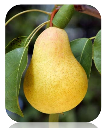
"Bartlett" and "Delicious" Pears (Pyrus communis)

Few pears ripen without cracking around the Bay, but a green Bartlett pear has thrived and produced nearly scab-free pears for 30 years on 11th St in Arcata, and the related "Delicious" variety is productive on Redmond Road. European pears need well drained soil and cross-pollination.