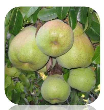
"Comice" and "Duchesse d' Angouleme" Pears

A Bosc pear is crunchy and sugary, a favorite for frugivores who love a crisp bite. Their thicker skin makes them the least prone to scab and cracking of the European pears, perhaps our best European pear on the Bay. Windsong and Eye St, Arcata.