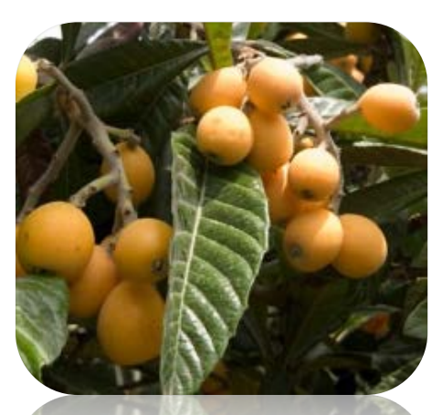
"Gold Nugget" Loquat (Eriobotrya japonica)

Sweet cherries do well on the Bay, especially mature trees. The short and easy-to-pick "Stella" variety produces sweet cherries on Foster Ave. The "Lapin" is a self-fertile sweet cherry that grows well on Roberts Way, Arcata. There was an 80-year-old "Bing" at HSU near CCAT that produced dependably for years. The recent invasion the Two Spotted Fruit Fly has sometimes meant perforated, leaky cherries in bad years. The "cherry slug" that nibbles leaves is actually a sawfly larvae and their damage is generally tolerable.