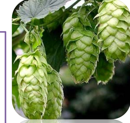
"Cascade", "Willamette" and "Shasta" Hops (Humulus lupulus)

Chocolate berries are pungent, tasting just like bitter dark chocolate mixed with red wine. They grow into a modest bush and fruit prolifically. This honeysuckle species is from the Himalayan mountains. Foster Ave.