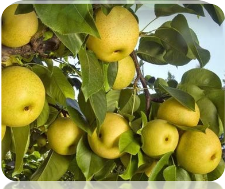
"Hamese," "Shinseiki," "20th Century," "Atago" Asian Pears (Pyrus pyrifolia)

Hamese is the earliest, juiciest and most refreshing (the author's favorite local pear), Shinseiki is smaller but sweet and perfumed, while 20th Century and Atago are thicker skinned and harvested a few weeks later. Leave Asian Pear on the tree until they are swollen and yellowed for best flavor. The trees are vigorous growers and the pears are sweet, juicy, and medium-large if thinned early in the season to allow the remaining pears to grow larger. Hilfiker St, Foster Ave, 8 Roberts Way.