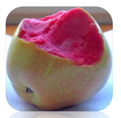
"Pink Pearl" Apple (Malus domestica)