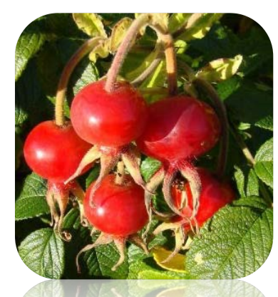
Saltspray Rose (Rosa rugosa)

This species grows throughout South America and is highly variable, with pleasant, juicy and wintergreen-tasting purple to pink to snow white berries on bushes 1-5' tall.