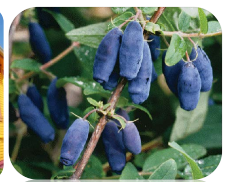
"Blue Moon", "Blue Forest" and "Blue Pacific" Honeyberry (Lonicera caerulea)

Small and sweet kiwis are available around the Bay, and the "Blake," "Hayward" and "Vincent" varieties have proven themselves. Kiwis grow vines big enough to swallow a house and must be pruned to keep them under control. They are a sexed plant, so a male and a female are necessary for fruit. However, hand pollination is easy if your friend has a male in blossom and you have a female. CCAT, Foster Ave, Roberts Way.