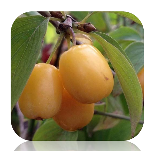
Cornelian Cherries: "Yellow", "Red Star," "Elegant," and "Pioneer" (Cornus mas)

Cornelian Cherry is actually a dogwood species from Greece with fruit similar to tart pie cherries that ripen until they fall from a gently shaken tree. Cornelian cherries are partially self-fertile but will do better when planted in pairs. "Yellow" is excitingly tangy with mango notes, and the only yellow varietyothers are red. "Red Star" is an excellent fruiter, "Pioneer" and "Elegant" are almost as good. A common purplish leaf discoloration doesn't appear to be a problem. Roberts Way, Arcata.