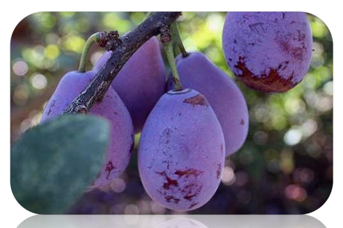
"Stanley," "Italian" and "French" Prune Plums (Prunus sp)

The "Methley" is a new proven sweet success while the "Beauty" is a local standard, smaller, less interesting tasting sweet plum. Potowat Health Village, 12th Street, Buttermilk and Roberts Way, Arcata.