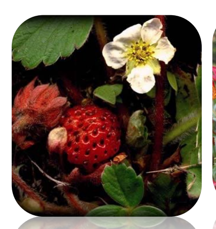
Beach Strawberry (Fragaria chiloensis)

The native beach strawberry of the Humboldt Bay is one of the two species of strawberry that were hybridized to make domesticated strawberries. The fruit is small and sweet, while the plant spreads vigorously with runners that can make a thick and attractive ground cover.