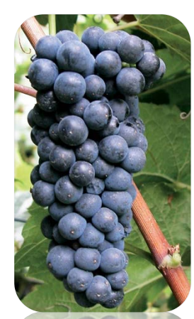
"Marechal Foch" (Vitis ripara x Vitus rupestris)

Venus has unusually large grapes for a seedless variety. The skin may be somewhat astringent, but it is well known for being a table grape and sweet wine grape. Near Wildberries.