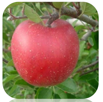
"Melrose" (Malus domestica)

A relatively recent and popular variety that is a proven success in the blustery Windsong neighborhood and Deep Seeded Community Farm . Famed for its exceptional sweet-tart flavor for eating out of hand, it also stores fairly well.