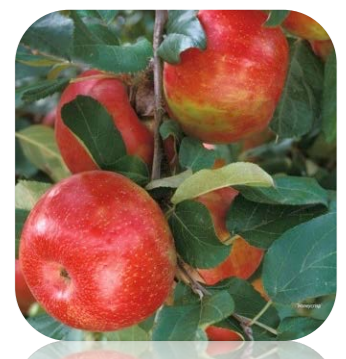
"Honeycrisp" Apple (Malus domestica)

Pronounced Ah-Ka-Nay, this is an early season apple with a balance of sweet and sharp flavors that was developed in Japan in the 1930s from the "Jonathan" and "Worcester Pearmain."