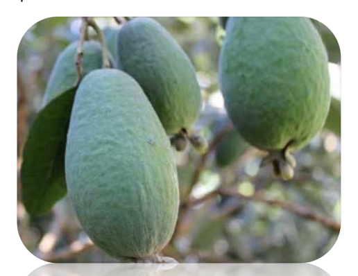
Pineapple Guava (Acca sellowiana)

The "Greengage" is a family of ancient heirloom plums developed in France from Turkish wild types and grown throughout Europe as a choice desert plum, frequently cooked in syrup to make a plum compote. The greenish colored flesh seems to confuse birds and the Greengage escapes being pecked. Richmond Road.