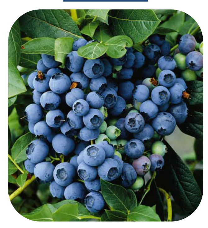
"Patriot" and "Blue Crop" Blueberries (Vaccinium ssp)

All blueberry varieties listed below thrive around Humboldt Bay and fruit well with irrigation but may struggle for the first years without irrigation. There are many species of plants called blueberries from all over the world, some of which are evergreen, some deciduous. Foster Ave, Eastern, Spear Ave, Arcata