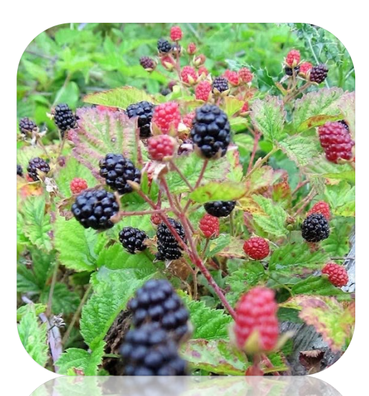
California Blackberry (Rubus ursinus)

Our native California Blackberries fruit in the Dunes in July, a month or more before the invasive Himalaya blackberries. The native berry is distinctly more flavorful, making a fruitier jam and a more enjoyable handful. Unfortunately they can be light bearers for the amount of thicket they create, and they require direct sun to sweeten up. Natural thickets with enough berries to make it worth your while are found on the North Jetty near the airport/drag strip.