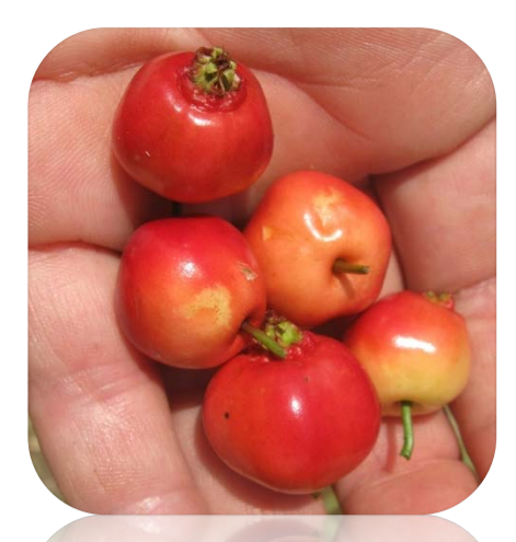
Mayhaw (Crataegus aestivales and opaca)

These varieties of the S. Europe and SW Asia sour cherries are self-fertile and have dark red flesh that makes for a classic cherry pie or dried and sweetened treat. Surefire is heavily productive at the Edible Hedgerow on 17th in Arcata, and self-pitting as you pick them. Montmorency and Morello are both successful on Wyatt Lane and Foster Ave, Arcata. Carmine Jewel is perhaps the best of all of them—showy flowers precede richly flavored, dark cherries on a 8' tall bush—it is crossed with P. Fruiticosa, a wild bush cherry. On Roberts Way, Arcata.